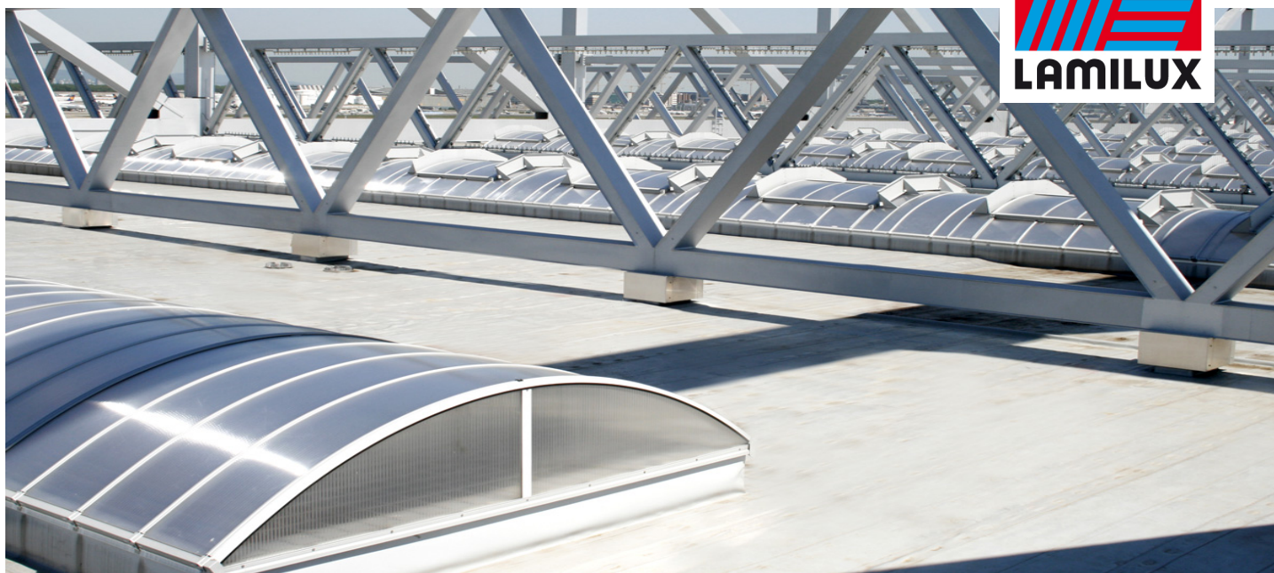
A380 Assembly Hangar