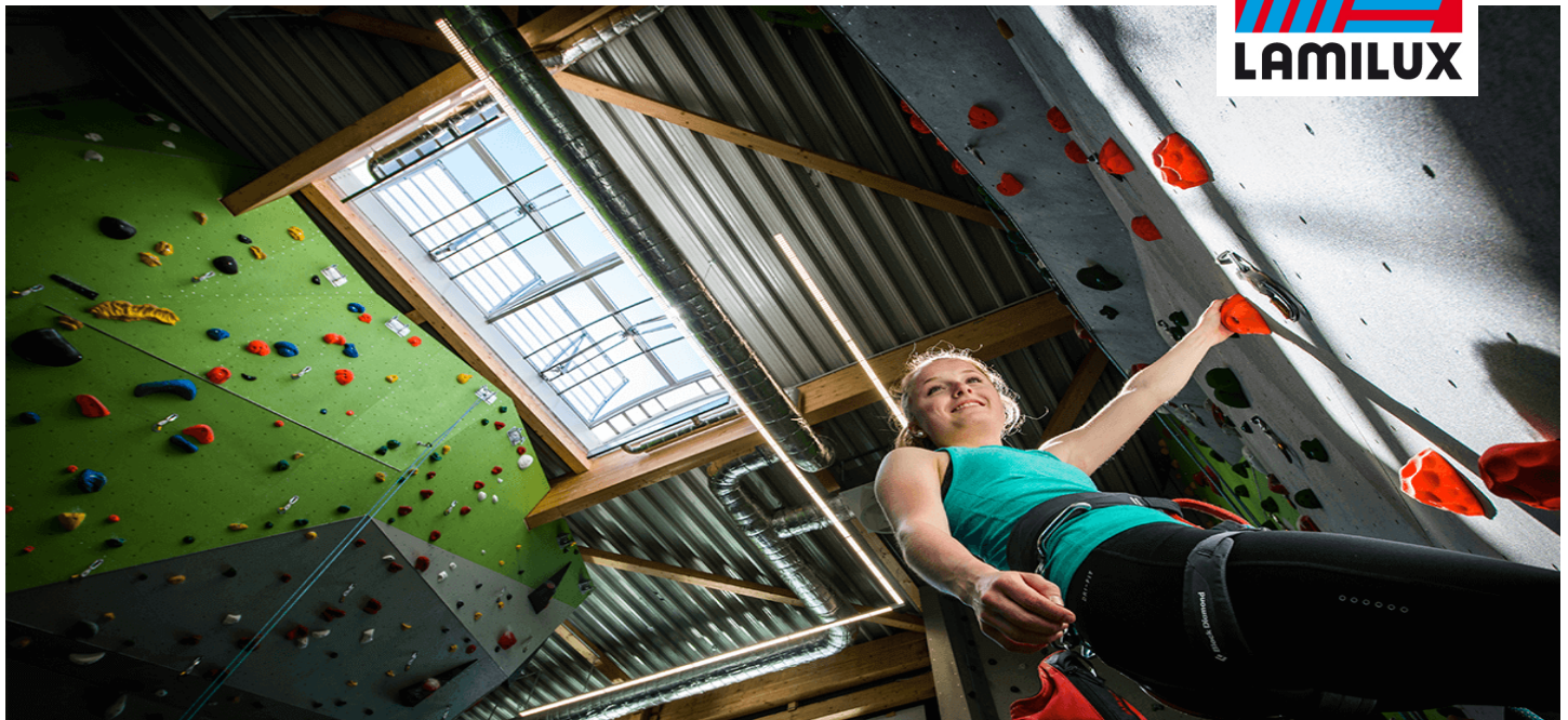
Climbing Centre OWL, Brakel