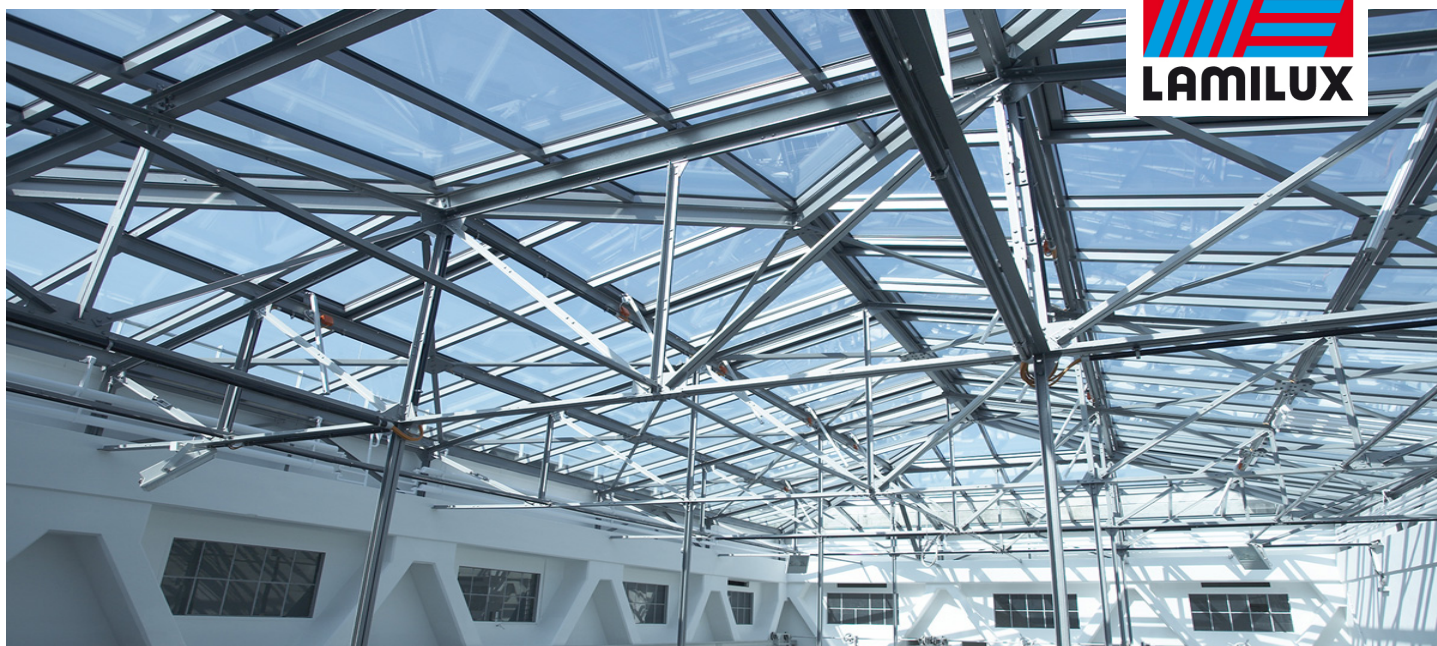
University of Music and Performing Arts, Munich