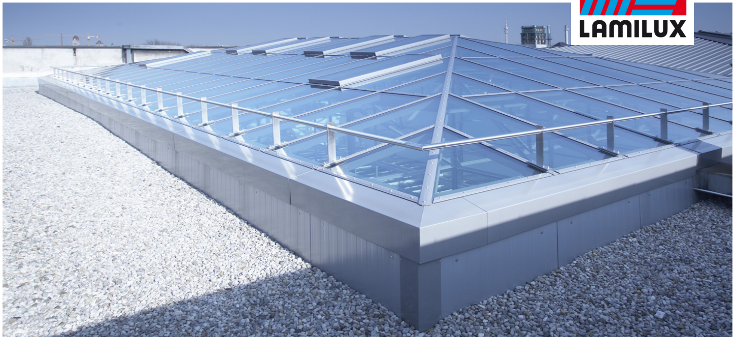
University of Music and Performing Arts, Munich